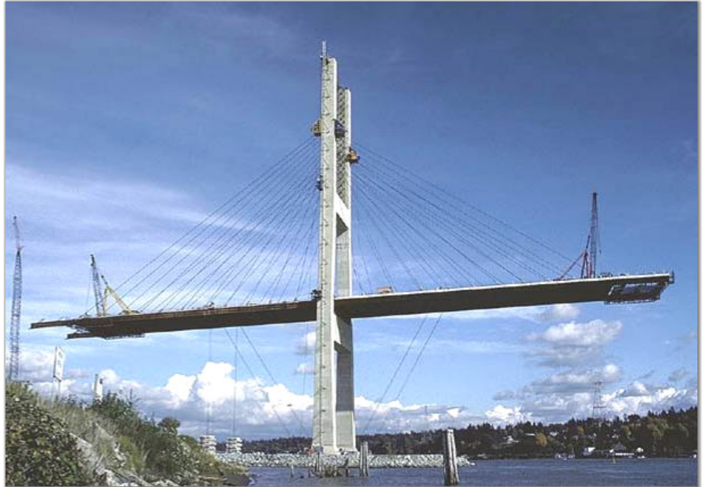
Balanced cantilever deck and stay cable erection at the North pier

SOMERSET also designed all purpose built erection equipment such as innovative self-jumping access platforms and cable-stay deflecting mechanisms to handle the 25 ton prefabricated stays. The steelwork and precast decks were erected by four stiffleg derricks supported by specially built tie-down frames which could be rolled ahead sequentially