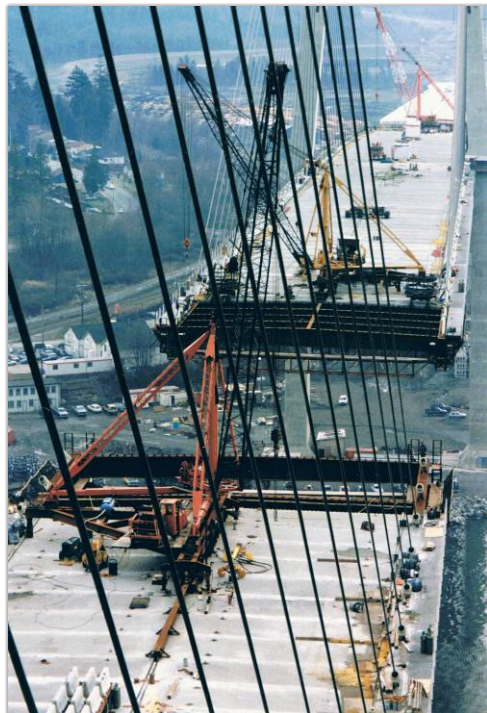
Stiff-leg derricks on travelling tie-down frames