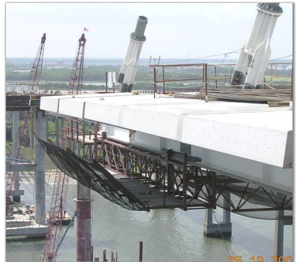
Under-slung travelling work platforms