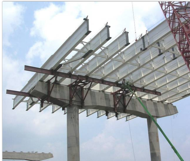
Somerset's pier bracket system used for approach girders

SOMERSET provided all structural steel erection methods and shoring and equipment design for the main span erection and erection analysis and shoring design for the approaches, of which 30% were curved