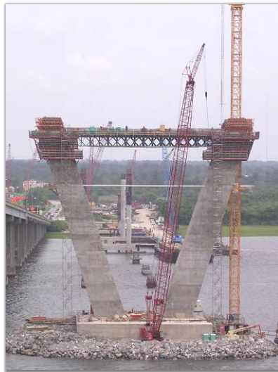
Temporary shoring truss